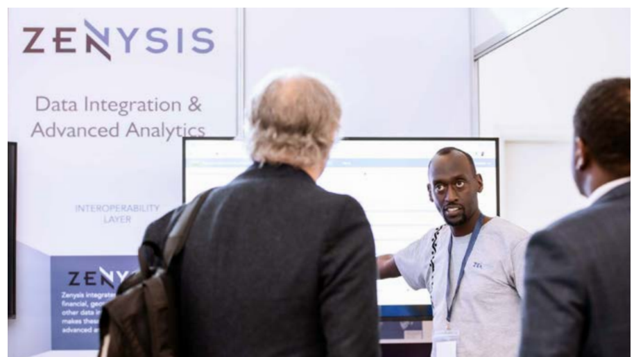
A Zenysis demonstration at the Rwanda Biomedical Centre's Health Research & Policy Symposium in Kigali, Rwanda, 27 May 2022.

Under the terms of the partnership agreement, Zenysis committed to deliver self-funded pilots of its technology in 10 countries: Bangladesh, India, Benin, Kenya, Liberia, Togo, Rwanda, South Africa, Zambia, and Mozambique. The Global Fund agreed to facilitate the pilots within our country portfolio.