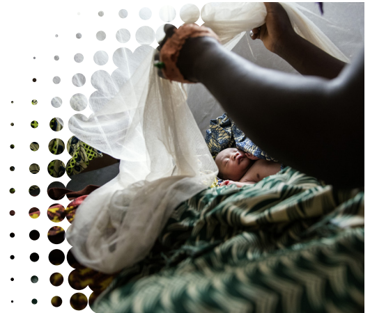
A mother puts up a mosquito net in N'Tabakoro, Kulikoro, on the outskirts of Bamako. Mali was one of the first countries in Africa to pilot new mosquito nets to combat insecticide-resistance.

Together with Mali's Ministry of Health, the Association pour la Résilience des Communautés vers l'Accès au Développement et à la Santé Plus, Catholic Relief Services and key technical and financial partners, the Global Fund is supporting interventions that aim to halve incidence rates for HIV and malaria, reduce TB incidence by 30%, and achieve a 50% reduction in mortality rates for the three diseases in the coming years. Global Fund investments also support Mali to strengthen pandemic preparedness and to enhance systems that will help the country withstand future health threats.