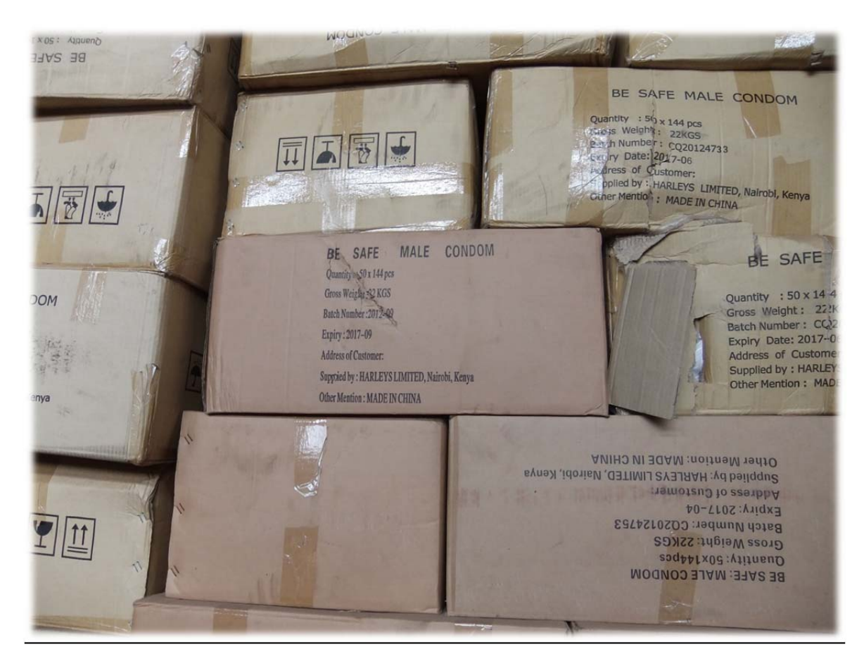
Chart C: Photos of Shipping Boxes and Labels with Different Fonts