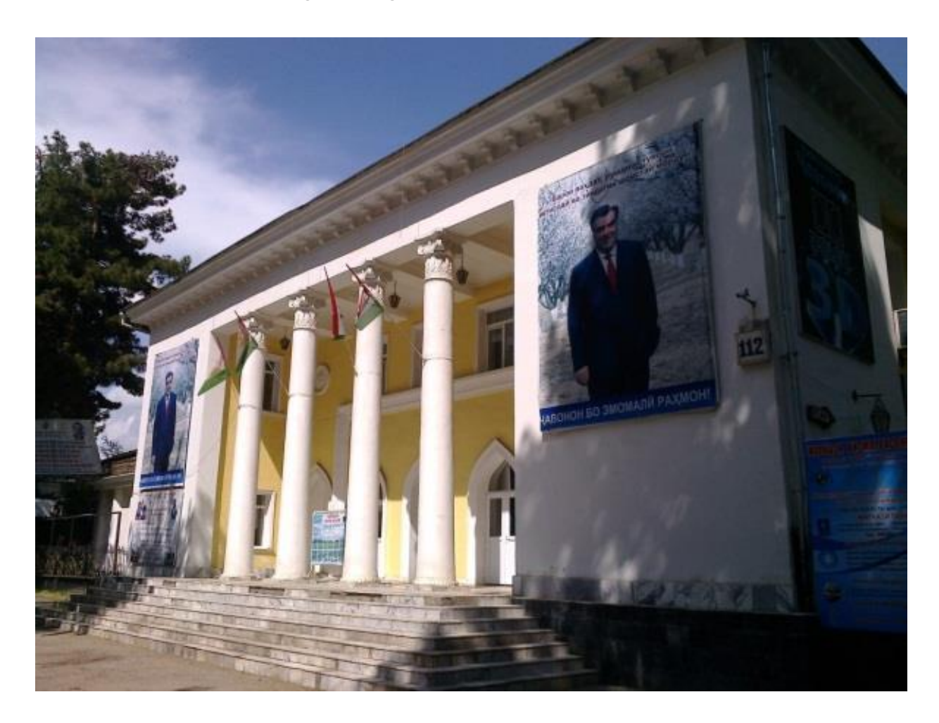
Exhibit 12 – Photo of legally registered address of Komyob (CYST address)