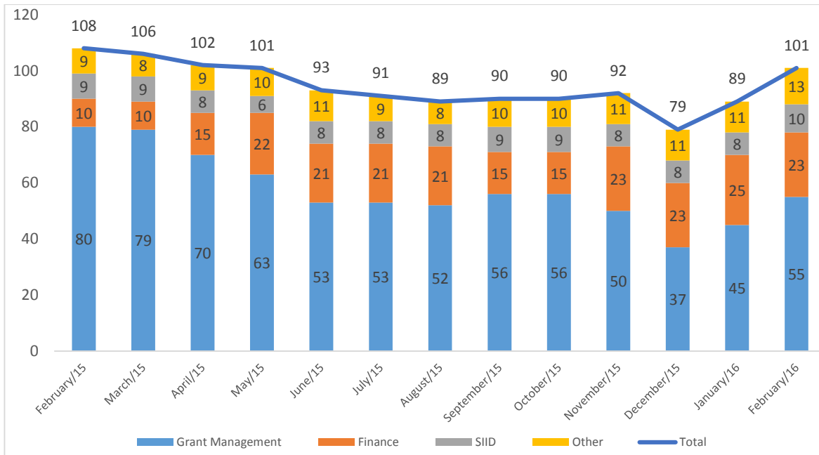
Table 1: Total open AMAs (excluding recoveries)

Table 1 shows the number of open AMAs over time per Secretariat division.