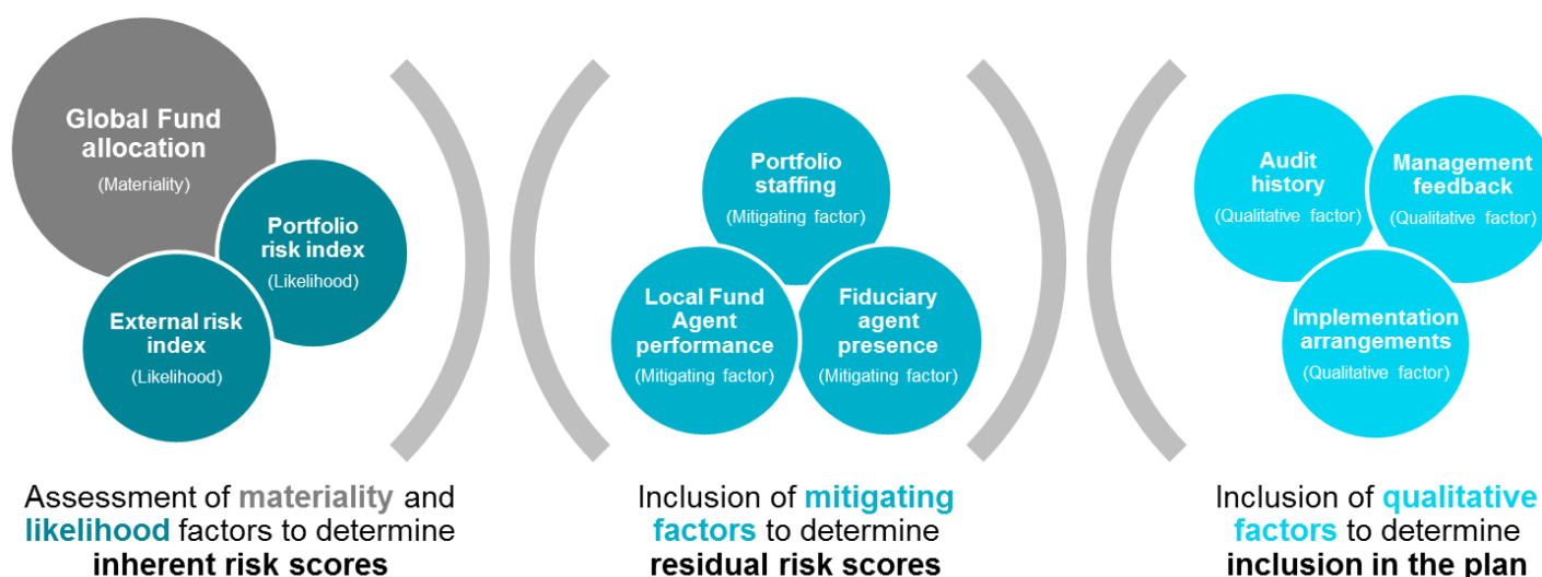
Figure 3. Risk-based methodology for choosing which countries to audit/investigate.

The OIG looks at both risk and materiality when selecting countries to review; this means that countries that are high in both categories are likely to be audited or investigated more frequently than those that are less material or less risky. Following this logic, the OIG is likely to audit or investigate countries such as Nigeria and DRC more often. It also means that countries that are “very high risk” (such as Syria or Iraq), but receive little funding, are likely to be reviewed less frequently.