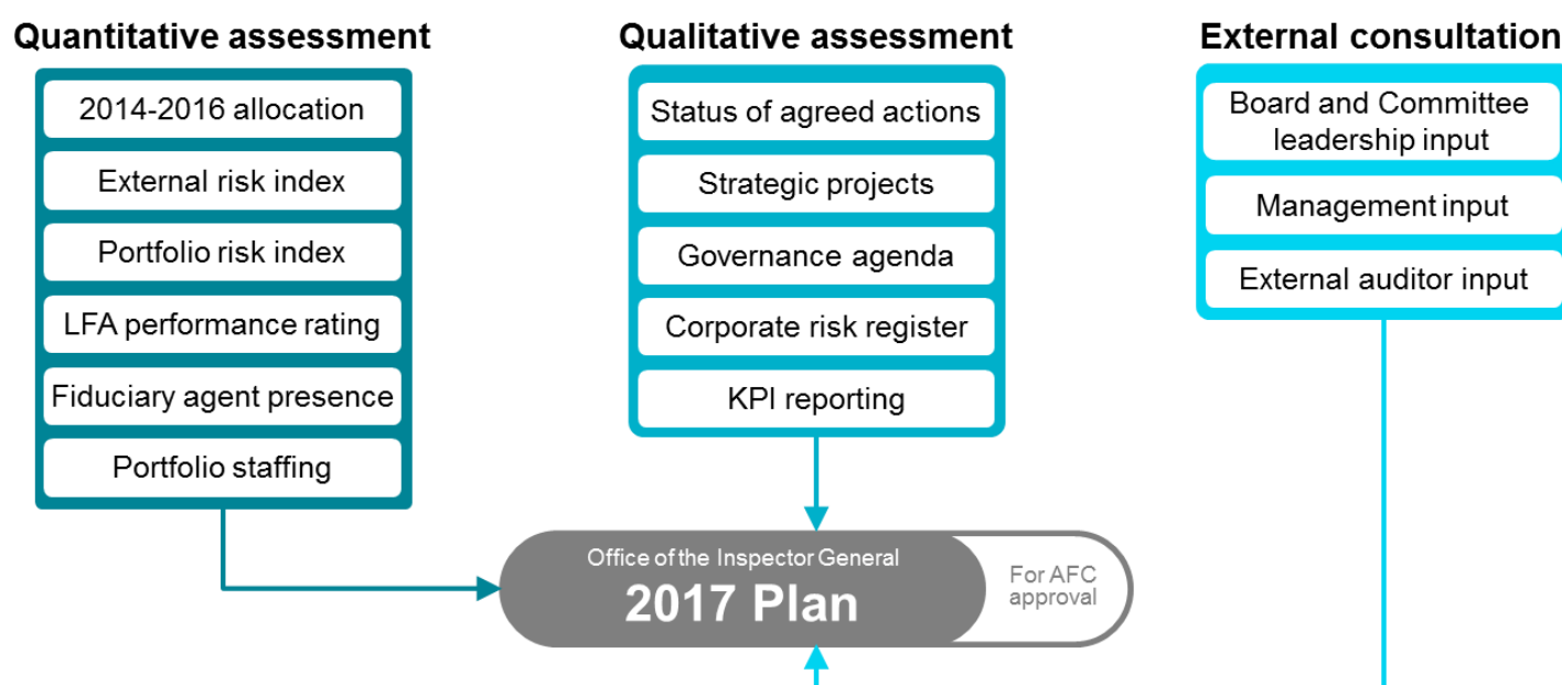
Figure 2. Three sources contribute to the OIG plan.

The plan draws from three sources: quantitative data, qualitative factors and inputs from various external stakeholders. More detail in the figure below.