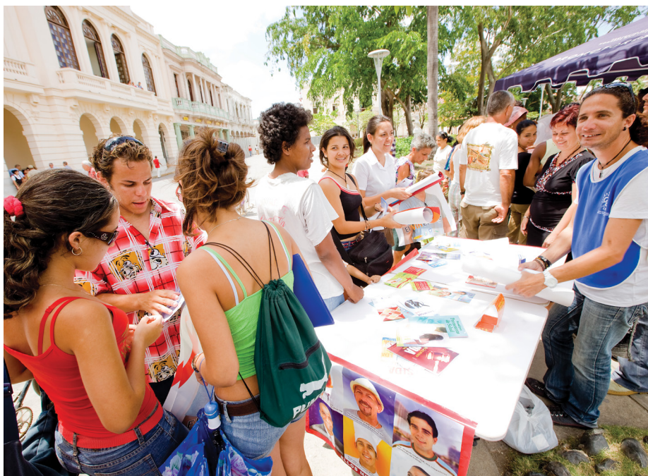
Community workers hand out condoms and educational materials in the city of Santa Clara, Cuba. Cuba is the first country to apply for transition funding for its HIV program. As part of the transition plan, Cuba has committed to take over treatment costs and services for key populations, such as men who have sex with men and transgender people.

systems, provision of integrated health services, support for national health strategies and efficient supply chains that together can prevent, detect and respond to outbreaks. By investing in these areas, we can strengthen the resilience and sustainability of the health systems upon which national disease responses are built. As more countries adopt sustainable and self-financed domestic health programs, the world will get closer to achieving security against global health threats.